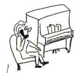
I just bought a used piano, how much is it to tune it?

The proposal to increase dues by $20 (to $325) is in response to decreased income. There are fewer membership renewals and attendance at the national convention is suffering. They suppose that it is due to changes in the economy. Additional membership incentives and discounts are also proposed. In past years the annual increase has been 3-4%.