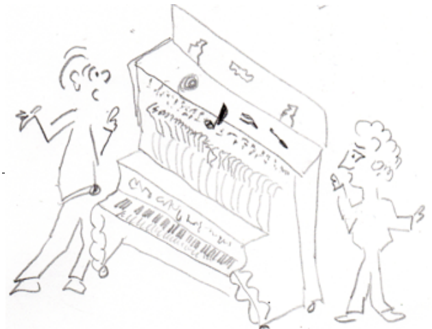
"Your piano wasn't designed to be tuned in equal temperament because equal temperament had not been invented yet."

For more information about why equal temperament is not always the cat's meow, see: "How Equal Temperament Ruined Harmony (and why you should care) http://www.amazon.com/Equal-Temperament-Ruined-Harmony-Should/dp/0393062279