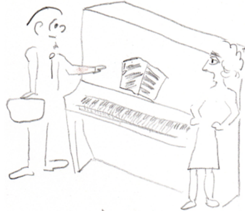
"I used the Thomas Young temperament because that sheet music wasn't composed with equal temperament in mind."