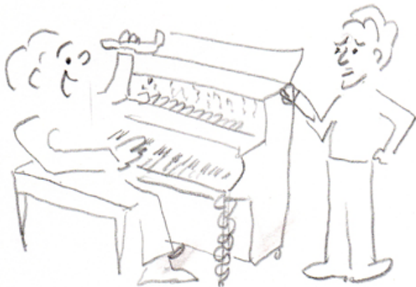
"I am going to tune the piano with the Vallotti temperament like the factory tuner!"