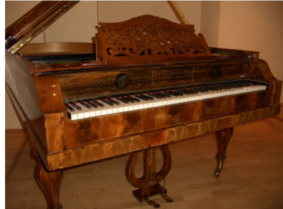
1839 Bösendorfer Grand

Company, beginning with only four pianos. Kimball continued to own and operate the Bosendorfer Piano Company of Vienna, Austria which was established in 1828. Ownership changed hands several times until Yamaha took over Bösendorfer in January, 2008.